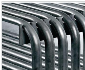
Steam Pipes Provide Uniform Heat