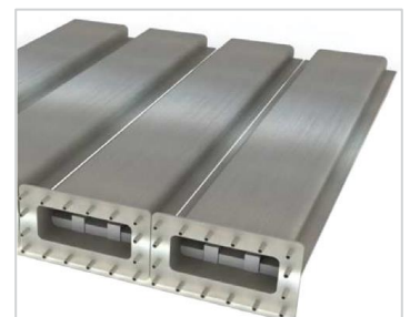
Robust Steam Generators