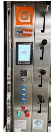
Shown: Zoom 1212 with TMB Touchscreen Control & Integrated Loader (Otto's Bread Company, Salinas, CA)