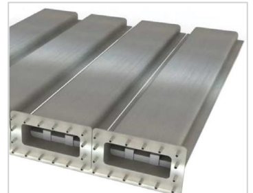
Robust Steam Generators

Heat Exchanger of Masonry & Concrete for Stable Baking and Quick Recovery Between Bakes