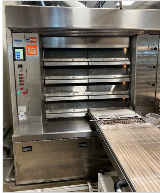
TUBIX with TMB Touchscreen Control* & Scissor Loader (Ad Astra Bread Co, Monterey, CA)

* Previously known as TMB Stoneheart Deck Oven