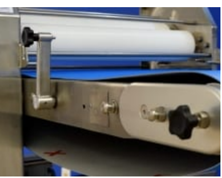
Quick Remove Belt