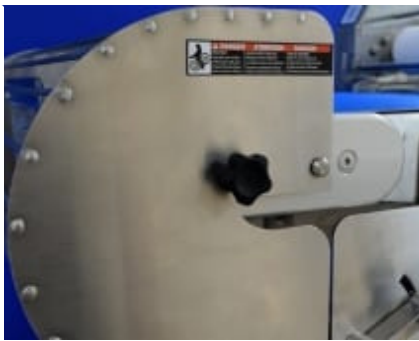
Safety Return Gaurd