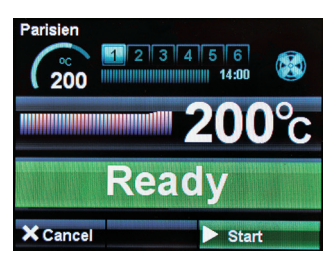
When the oven reaches the correct temperature the ready screen will show.