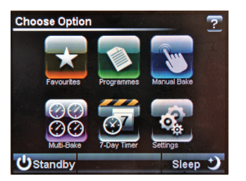
User-friendly color touch controller.