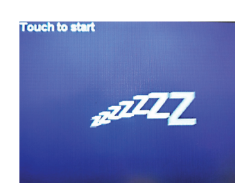
Putting the oven into sleep mode between bakes help save energy.