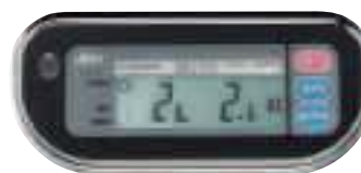
Lb/decimal oz mode, SK-WPZ models