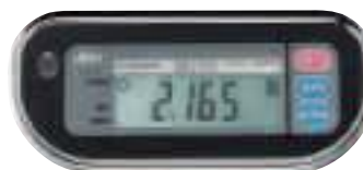
Lb mode, SK-WP models