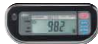
Metric mode, SK-WP models