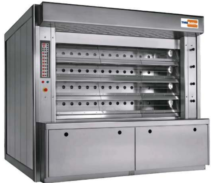
Stoneheart Gas Deck Oven

Foundation, Flues and Burner —The foundation of the Stoneheart Gas Deck Oven is made of steel, followed by a layer of rock wool insulation, steel panels and finally high-temperature, refractory brick and concrete (flue) for the heat generated by the burner. The TMB Stoneheart Gas Deck Oven uses more of these materials than most, if not all other ovens (except the TMB TAG), ensuring the significant thermal mass for heat retention and more consistent heat distribution for the perfect backing system of any style of bread. TMB employs a US manufactured, UL and AGA listed gas burner, generating up to 350,000 BTU's