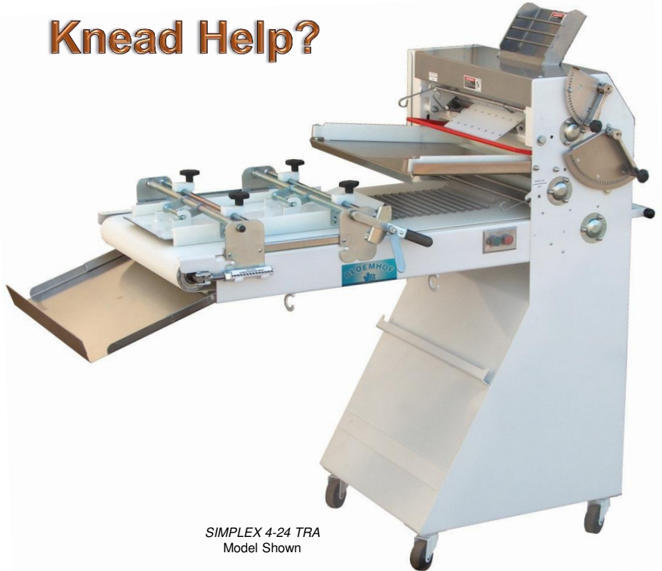
SIMPLEX 4-24 TRA Model Shown