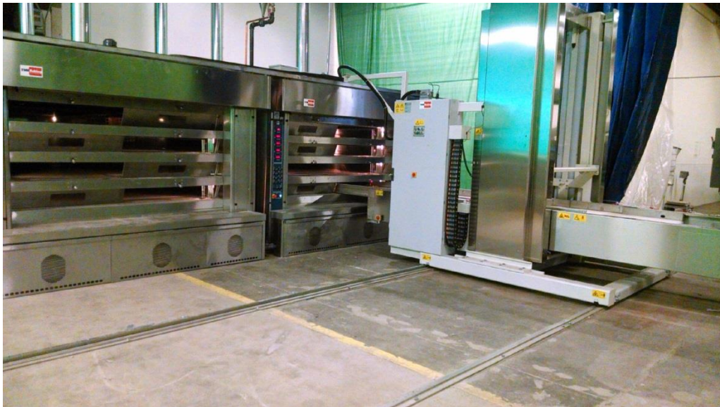
Marden iDEA 1125 Loader Serving 2 TAG 4-12-280 Gas Deck Ovens